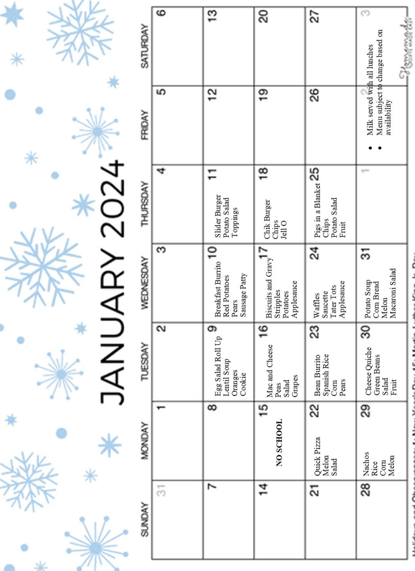
Holidays and Observances: 1: New Year's Day, 15: Martin Luther King Jr. Day